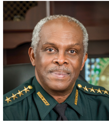
BROUGHT TO YOU BY: