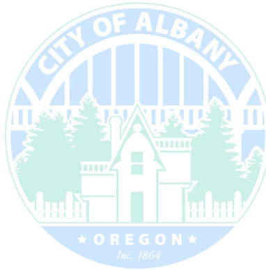
PHOTO RED LIGHT REPORT TO LEGISLATURE Process and Outcome Evaluation