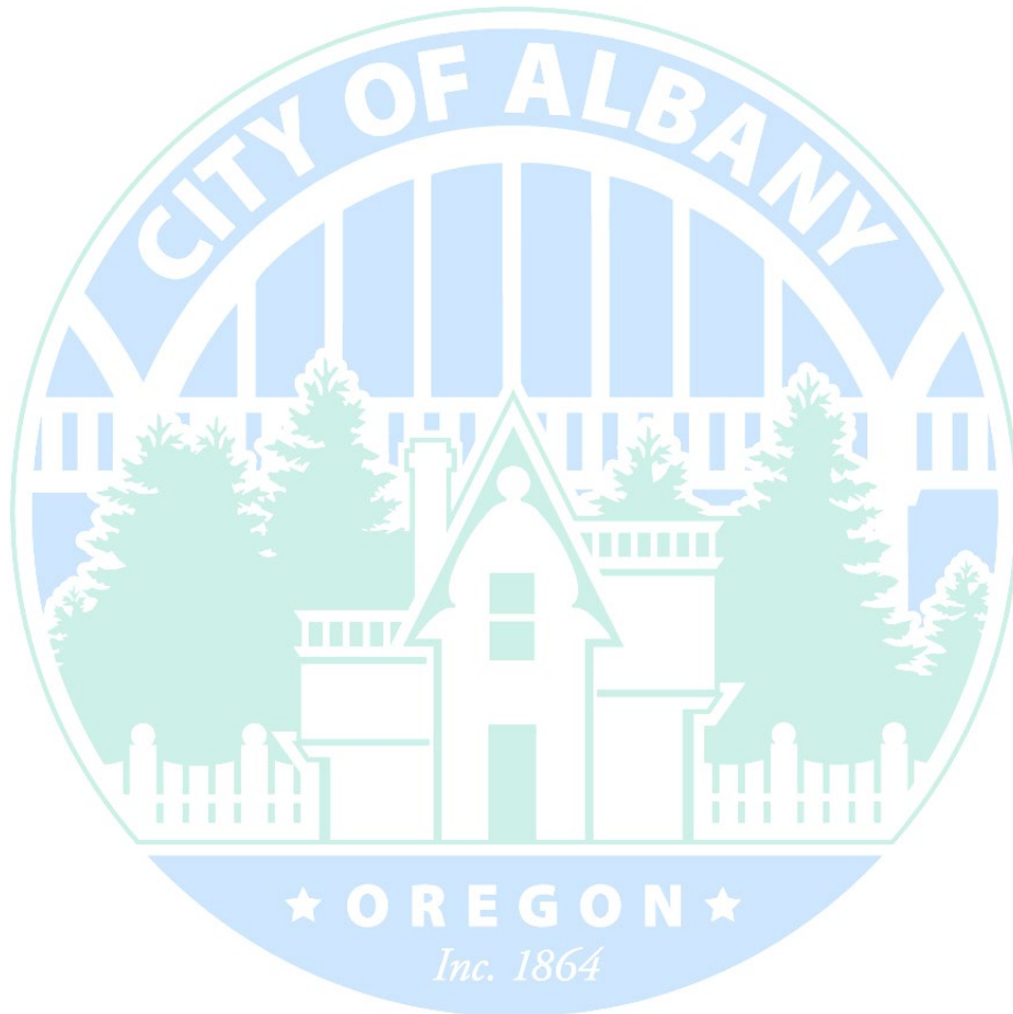
PHOTO RED LIGHT REPORT TO LEGISLATURE Process and Outcome Evaluation