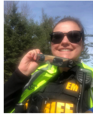
Solar Eclipse 2024