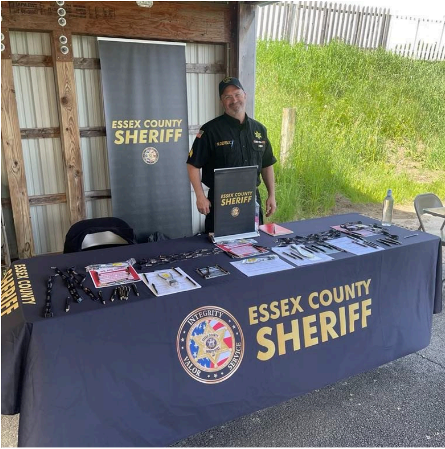
Essex County Fair Public Information Table