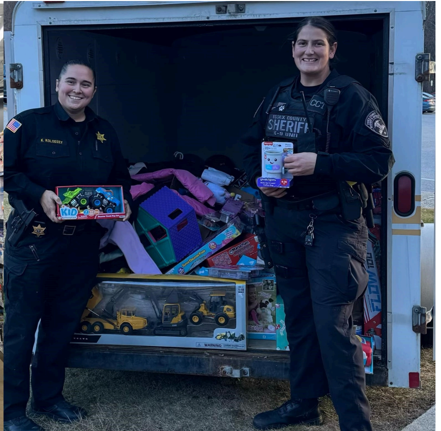
Christmas 2024 Events