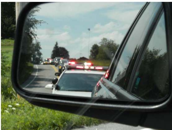
View of Funeral Procession