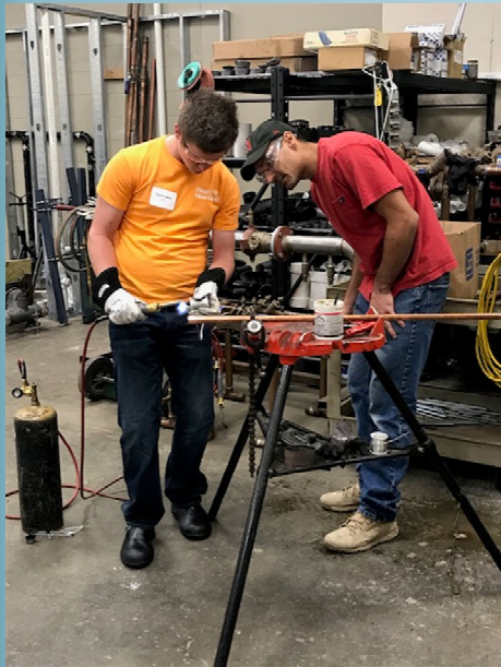
Student participating in a hands-on learning experience at a local apprenticeship program.

Iowa Vocational Rehabilitation Services (IVRS) works with students with barriers to employment by providing Pre-Employment Transition Services (Pre-ETS).