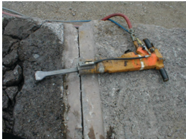
Jackhammer equipped with water spray delivery system to control dust. The water nozzle is mounted on the jackhammer frame just to the right of the chisel. Note the wet concrete on left from the water spray.

When working indoors or in an enclosed space (areas where airborne dust can buildup, such as a structure with a roof and three walls), employers must provide additional exhaust, as needed to minimize the accumulation of visible airborne dust. See the section on Indoors or Enclosed Areas for more information.