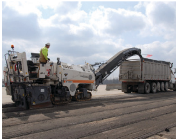
Milling machine milling asphalt road and loading debris into haul truck.

Respiratory protection is not required for work with small drivable milling machines (less than half-lane) regardless of task duration.