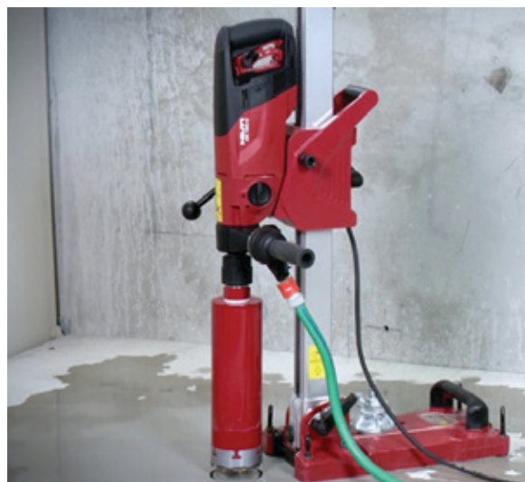
A rig-mounted core drill with an integrated water delivery system.

Respiratory protection is not required for work with rig-mounted core saws or drills regardless of task duration.